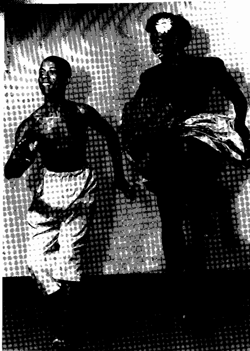
Joe Nash and Pearl Primus in Primus's Haitian Play Dance, on tour, ca. 1946

the African American Tradition in Modern Dance program at the American Dance Festival.