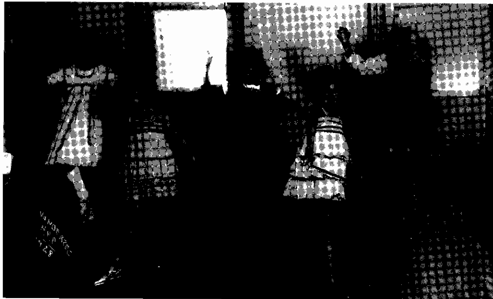
“Dance Class, 1928” (Photograph by James Van Der Zee; copyright © Donna Mussenden Van Der Zee; all rights reserved; reproduced with permission)

Scholars of African American dance history face a battery of unusual challenges. Reliable documentation of dance events predating the mid-twentieth century is slight; few research centers or major libraries contain specialized collections chronicling African American dance performance, and misreadings of racial separation and racist attitudes permeate early writing about African diaspora culture in America. Frustrated by the painful lack of focused research and criticism and the absence of credible source material, many historians interested in African American dance slip away from the field to the safety of literary studies, labor studies, cultural studies, or art-making. Finally, there is the issue of categorization, complicated by critics who variously refer to the broad spectrum of expressive idioms practiced by African American artists as “African American dance” or the equally amorphous “black dance.” How has this happened?