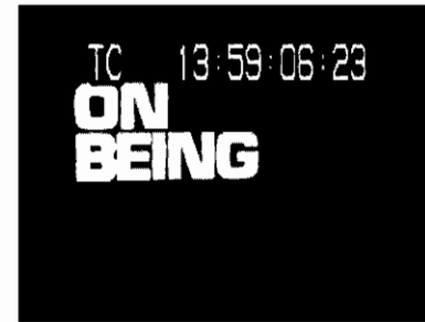
Title sequence from On Being Black , WGBH television program, 1969